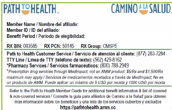
(ID card front)